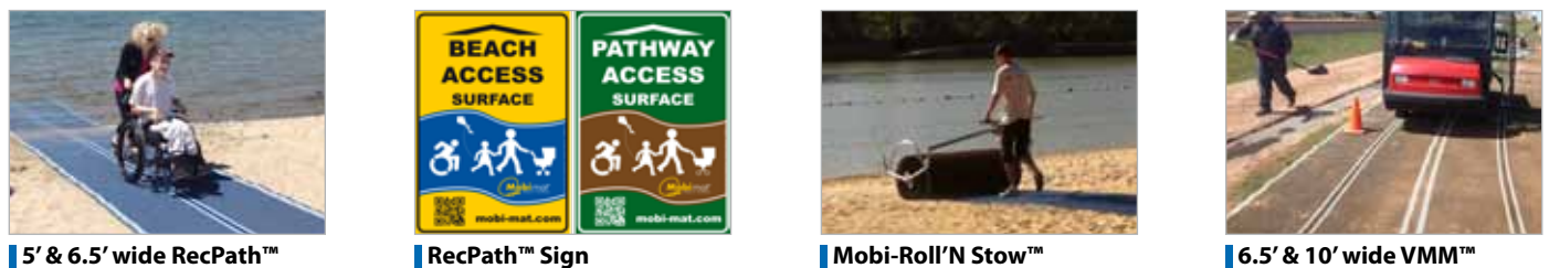
5' & 6.5' wide RecPath™

• Discover our complete range on www.mobi-mat-chair-beach-access-dms.com