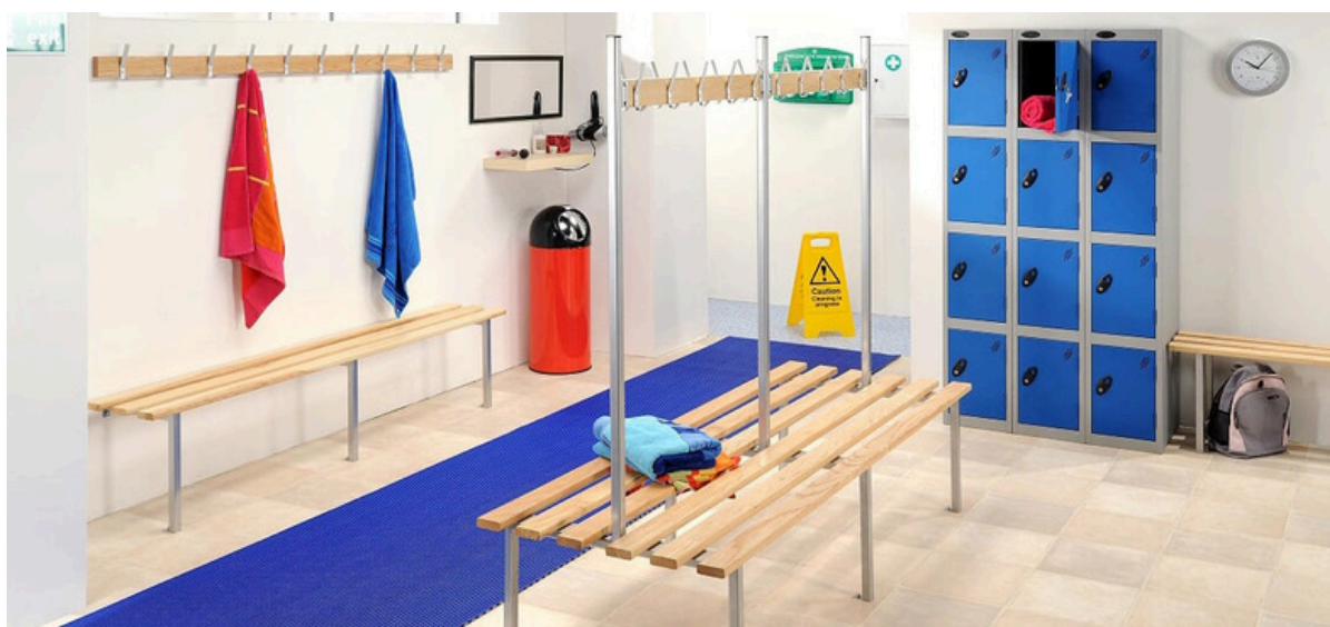
Wetfloor is installed in a locker in St-Nicolas de Port, France