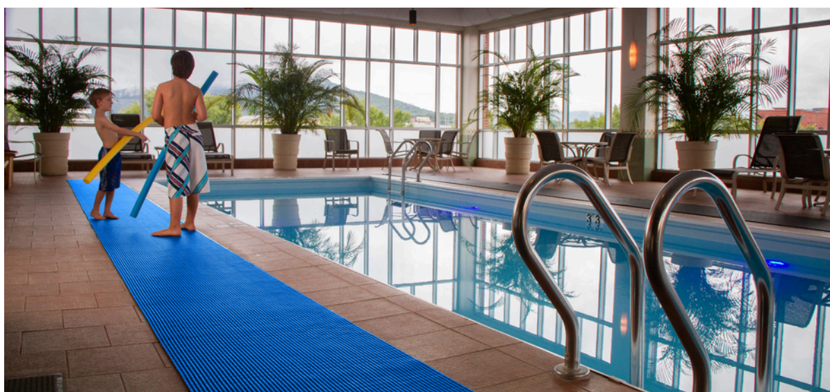
Wetfloor is installed to secure the edges of a pool in Alsace, France